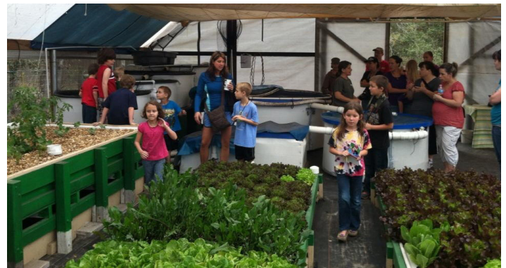
Figure 1. Aquaponic media filled bench bed (left) floating raft system (right) and recirculating tanks and filters (top) at Green Acre Aquaponics, Brooksville, FL.

(Francis-Floyd et al. 2012) to nitrate nitrogen (Fig. 2), one of the most important mineral nutrients required by plants.